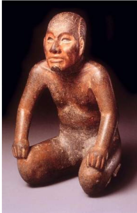
Figure 2: The “Princeton Shaman”: Shaman in Transformation Pose, Olmec, ca. 800 B.C. An image of the marine toad Bufus marinus is incised on the figure’s forehead.