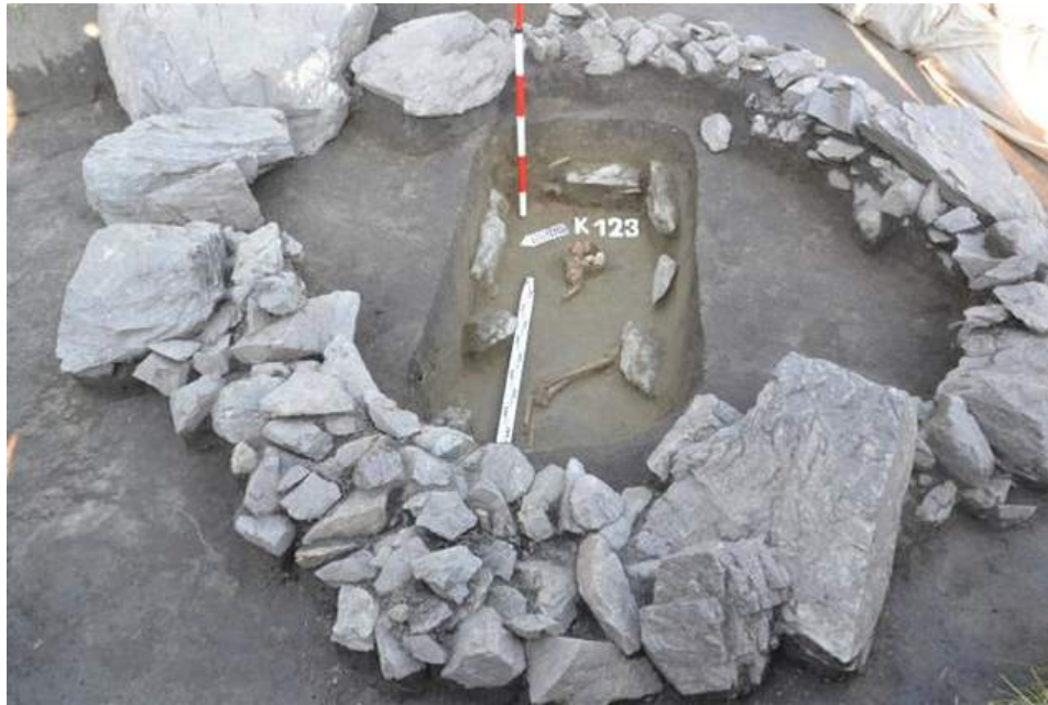
Figure 3: Scythian burial, Upper Chui Valley in Altai, Russia.

passage tombs or dolmen such as the site of Knowth, County Meath, are likely to have been designed as “multisensorial experiences” in which darkness and acoustic resonance could produce altered states of consciousness (Twohig 1981; Watson 2001; Wesler 2012; Lewis-Williams and Dowson 1993).