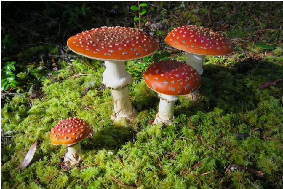
Figure 1: Amanita muscaria is a mushroom species traditionally used in shamanic activities by indigenous Siberian and Baltic cultures such as the Saami of Finland and the Koryaks of Eastern Siberia. Shamans used it as an alternative method of achieving a trance state. In most cases, however, Siberian shamans achieve trance by prolonged drumming and dancing.